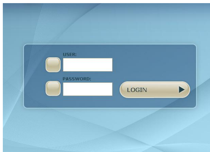
Personalized workflow for the logged in user