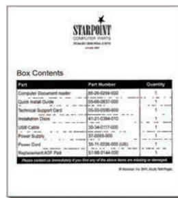
Acuity Enhanced Scan