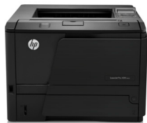
(HP LaserJet Pro 400 M401n)