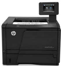
(HP LaserJet Pro 400 M401dn/dw)