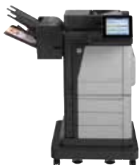
HP Color LaserJet Enterprise Flow MFP M680z