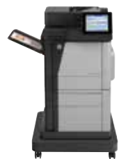
HP Color LaserJet Enterprise MFP M680f