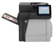
HP Color LaserJet Enterprise MFP M680dn

Tackle high-volume jobs with a high-performance color MFP. Print and copy on letter and A4, plus scan and fax. Enhanced scanning and an 8-inch color touchscreen streamline workflows. Mobile printing options help you stay productive on the go. 2,8