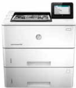
HP LaserJet Enterprise M506x