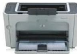
HP LaserJet P1505 Printer