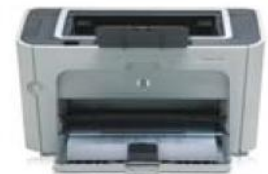
HP LaserJet P1505n Printer