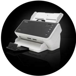
Kodak S2040/S2050/S2070 Scanners