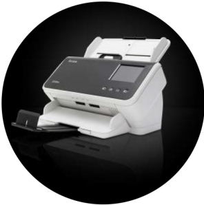
Kodak S2060w/S2080w Scanners