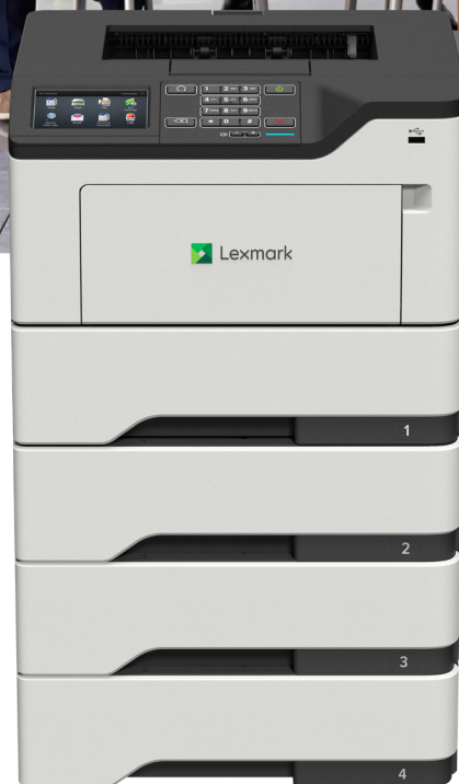
MS622de with optional trays