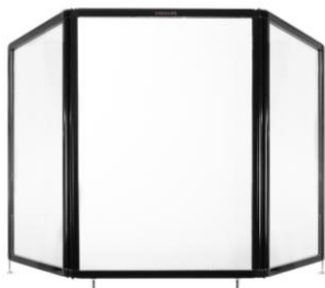
Part # HS66910