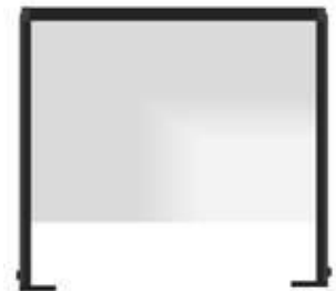
Part # HSW32902