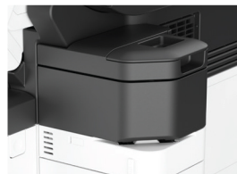
Optional offline convenience stapler shown.

Leverage your investment in a productive MICR printing solution with one that also serves as an all-in-one office assistant. The IM 430FbM easily handles all of your daily business communication needs in addition to check printing. The 50-sheet SPDF speeds image capture for efficient two-sided copying, scanning and faxing. There's even an optional offline convenience stapler available.