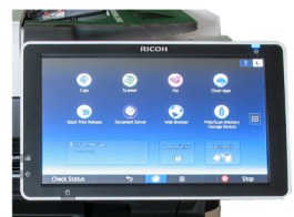
The intuitive 10.1" Smart Operation Panel is customizable.

The IM 430FbM supports PCL 5e, PCL 6 and PostScript3 emulation for Windows with point-and-click simplicity and dozens of fonts for printing in many creative styles. The 10.1" Smart Operation Panel puts a full suite of image and document reproduction features at your fingertips, while standard Super G3 Faxing keeps your office in touch with customers and vendors outside the data network.