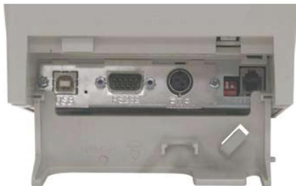
Dual RS232 Serial/USB Interface Shown Above

The A798 represents the next generation of reliable, high performance, low priced receipt printers. Built on CognitiveTPG's reputation for delivering durable printers, the A798 combines exceptional print speed with a small footprint, standard dual interface, and monochrome printing.