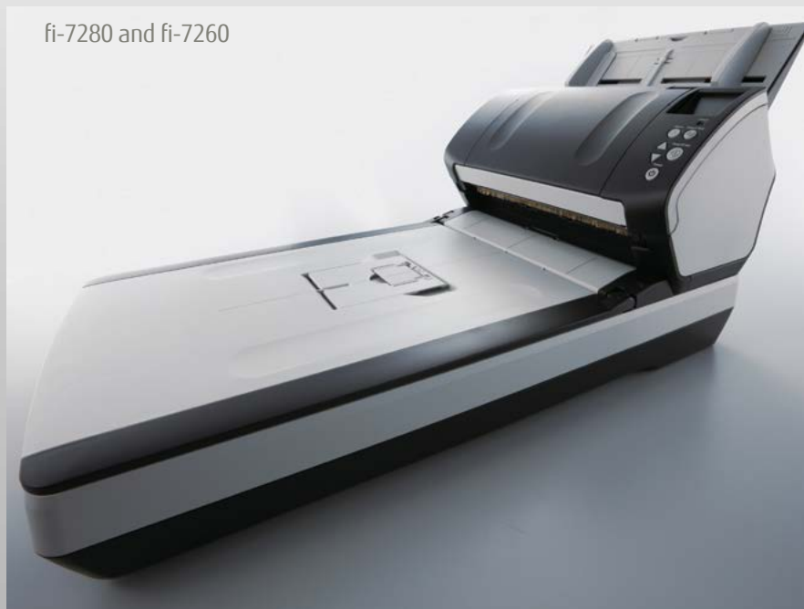
fi-7280 and fi-7260

Carrier sheets allow you to scan documents, larger than A4 or photos and clippings that are at risk of being damaged when processed through an ADF. {Part Number – PA03360-0013}