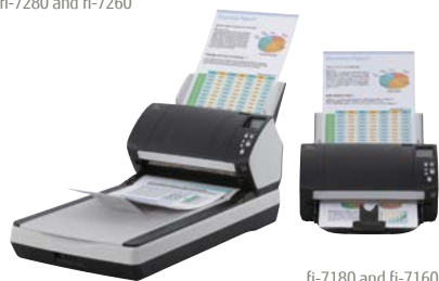
fi-7180 and fi-7160

fi-7160/fi-7260 – A4 Portrait at 300dpi 60ppm/120ipm fi-7180/fi-7280 – A4 Portrait at 300dpi 80ppm/160ipm Scan mixed batches up to 80 sheets