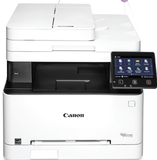
imageCLASS MF642Cdw Item Code: 3102C012