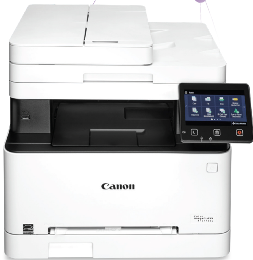
Color imageCLASS MF644Cdw Item Code: 3102C005