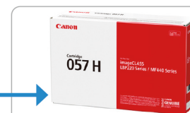
Hi-Yield Cartridge-057 H (Yield up to 10,000 pages)

Use of Canon GENUINE toner cartridges helps provide longer equipment life, high yields, reliable performance, high-quality output, and minimal jamming or issues.