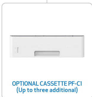
OPTIONAL CASSETTE PF-C1 (Up to three additional)