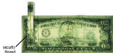
Figure D - Series 1990 through 1995