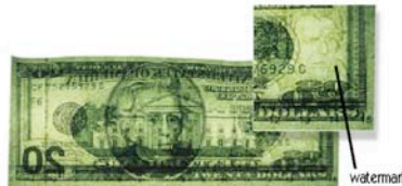
Figure C - Series 1996 and later