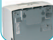
Vertical Wall Mount