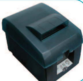
Optional Splash Proof Cover