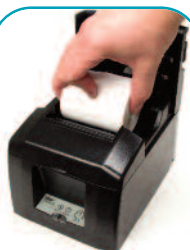
Easy Drop-In & Print